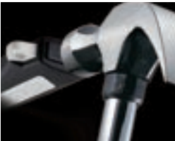
Sufficient striking end