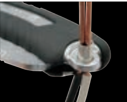
Equipped with lanyard attachment hole that also holds and attaches a cable crimp sleeve at the hole