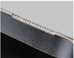
Cut thin wires with cutting notches