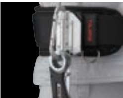
Wrench hole allows attachment to a carabiner