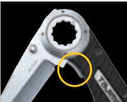
With pushing the blade stopper down, fold the blade inward