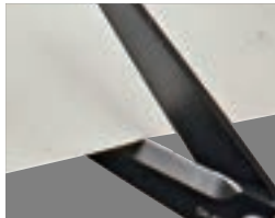
Adhesive-resistant Fluoro-Coat blades

Cutting capacity • Electrical tapes • Stranded wire with cross-sectional area of 2.0 mm 2 or less • PP strapping band