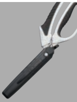
Protective blade case