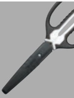
Protective blade case